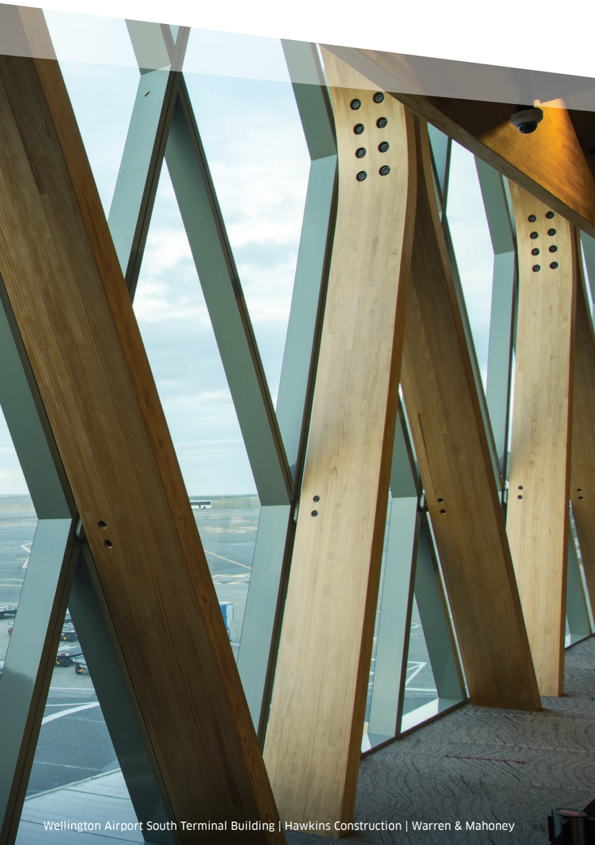
Wellington Airport South Terminal Building | Hawkins Construction | Warren & Mahoney